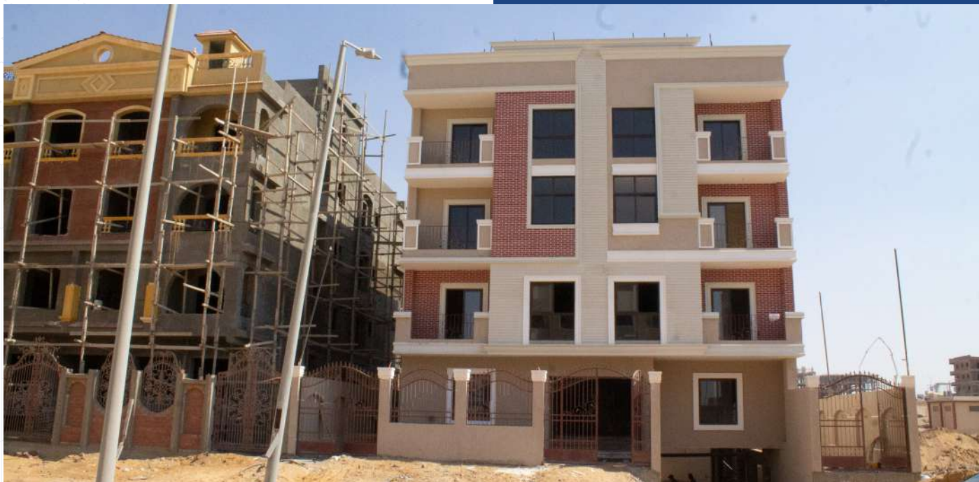
DISTRICT 6-M21-BAIT ALWATAN-NEW CAIRO