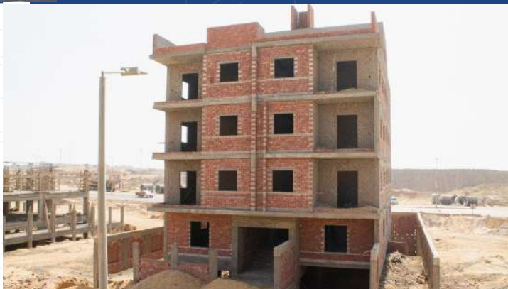
M17-BAIT ALWATAN-NEW CAIRO