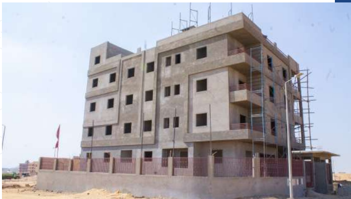
J63-BAIT ALWATAN-NEW CAIRO